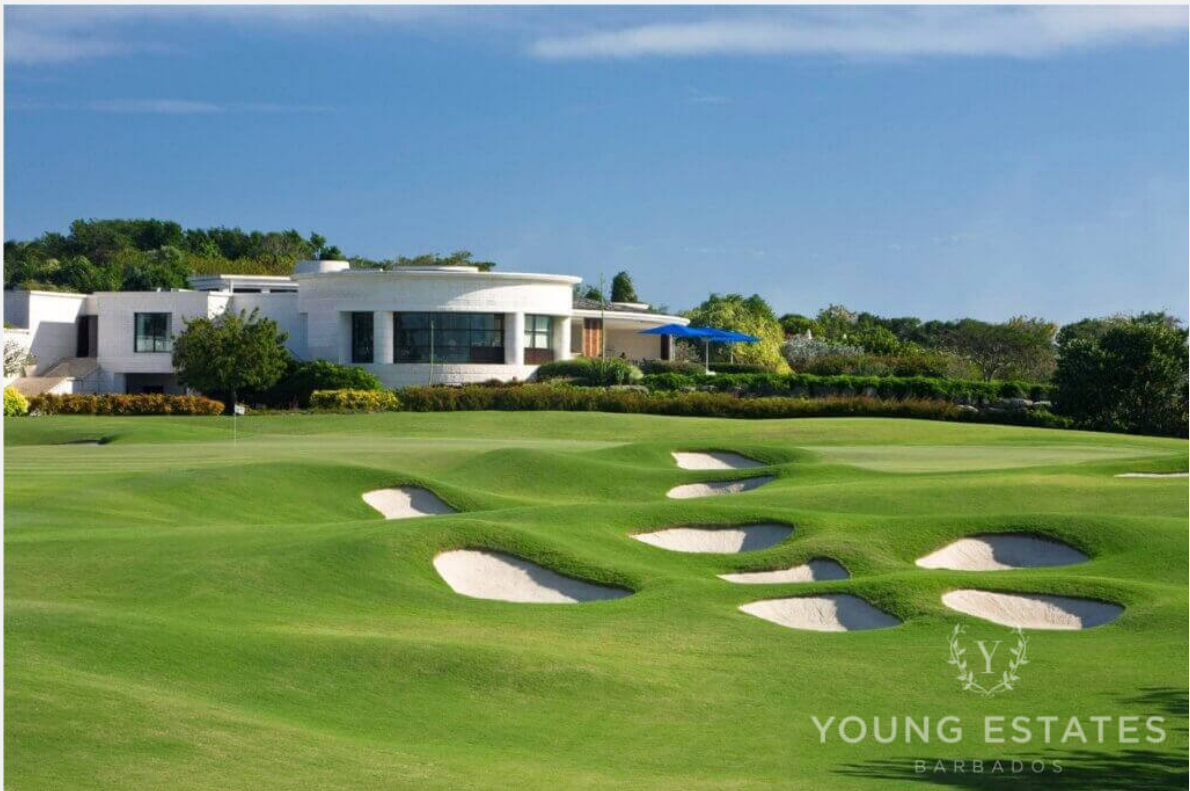
The Old Nine at Sandy Lane