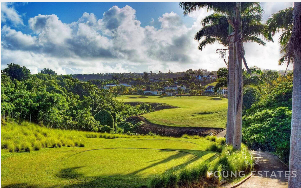
Royal Westmoreland Resort